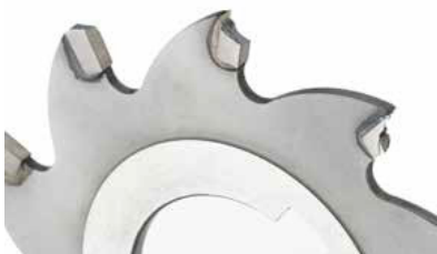
Carbide-tipped saw with worn, broken carbide inserts.