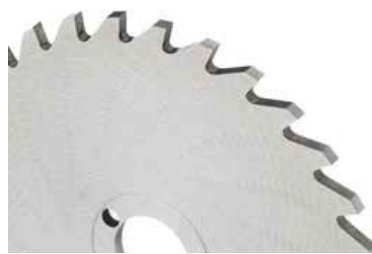
Solid carbide saw with sharpened and reconditioning teeth provides maximum cutting capability.