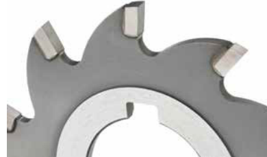
Carbide-tipped saw after re-tipping and sharpening in optimum condition.