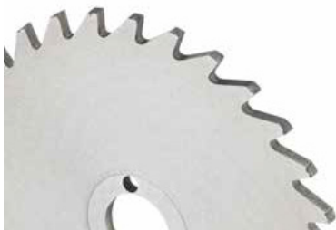
Solid carbide saw with dull, worn teeth.